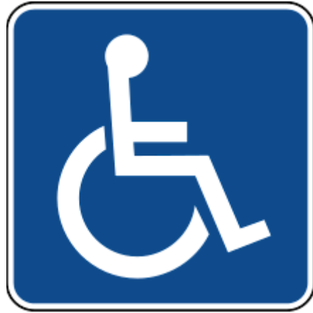
International Handicap Symbol